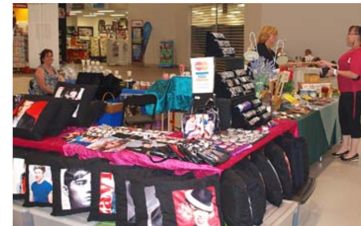
Lakeside Square's unique "I Made It" Market every Wednesday

We also look forward to the Café and Pizza Shop opening shortly, very welcome additions to the ever growing team at Lakeside Square. The 'I Made It Market' continues to gain momentum, every Wednesday the Centre plays host to local businesses. Stalls range from custom printing, candles & melts, woodwork, jewelry, children's products and more. Come down and support your fellow residents whilst doing your shopping.