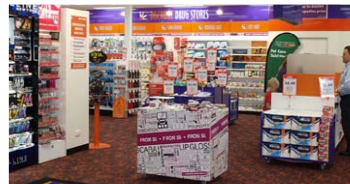
Discount Drug Stores Lakeside Square has a huge range of medicines, health care solutions and beauty needs at everyday low prices.

A warm welcome to all the specialists that have joined the team at Lakeside Square Medical Centre, the management team in the Medical Precinct are working hard to ensure Pakenham residents have access to a vast array of medical professionals. See inside for more details.